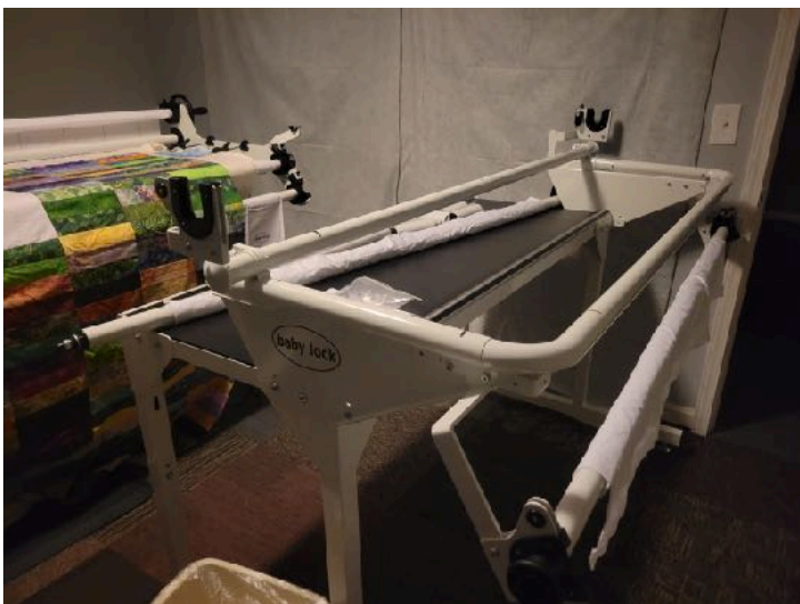
Baby Lock quilting frame with upgrade kit - $1000 or best offer